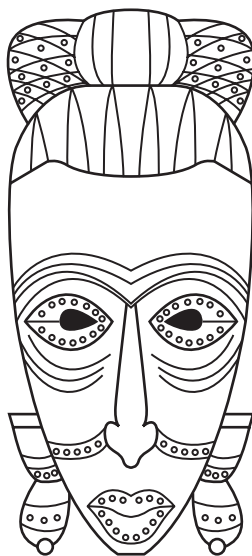
One Example of an African Tribal Mask

Many people view African tribal masks as decorative art. Unfortunately, few people understand just how special these masks are. For African tribes, the masks serve a very important cultural purpose. They represent a large component of the beliefs of the tribe. African tribal masks should be celebrated for their cultural importance to the tribes, not just for their beauty.