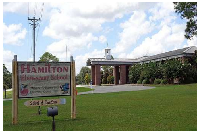
Colquitt County Schools Parent and Family Engagement Plan