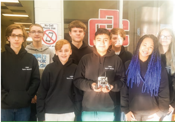
Cowan Road Middle School Robotics Team advanced to the FIRST LEGO League state competition.

The GSCS Nutrition Department received honorary recognition for their Farm to School Excellence at the 2018 Golden Radish Awards. The Golden Radish Award publicly recognizes Georgia school districts for best practices in farm to school programs, such as local food procurement, exposing students to new foods through taste tests and incorporating gardening and cooking activities in curriculum.