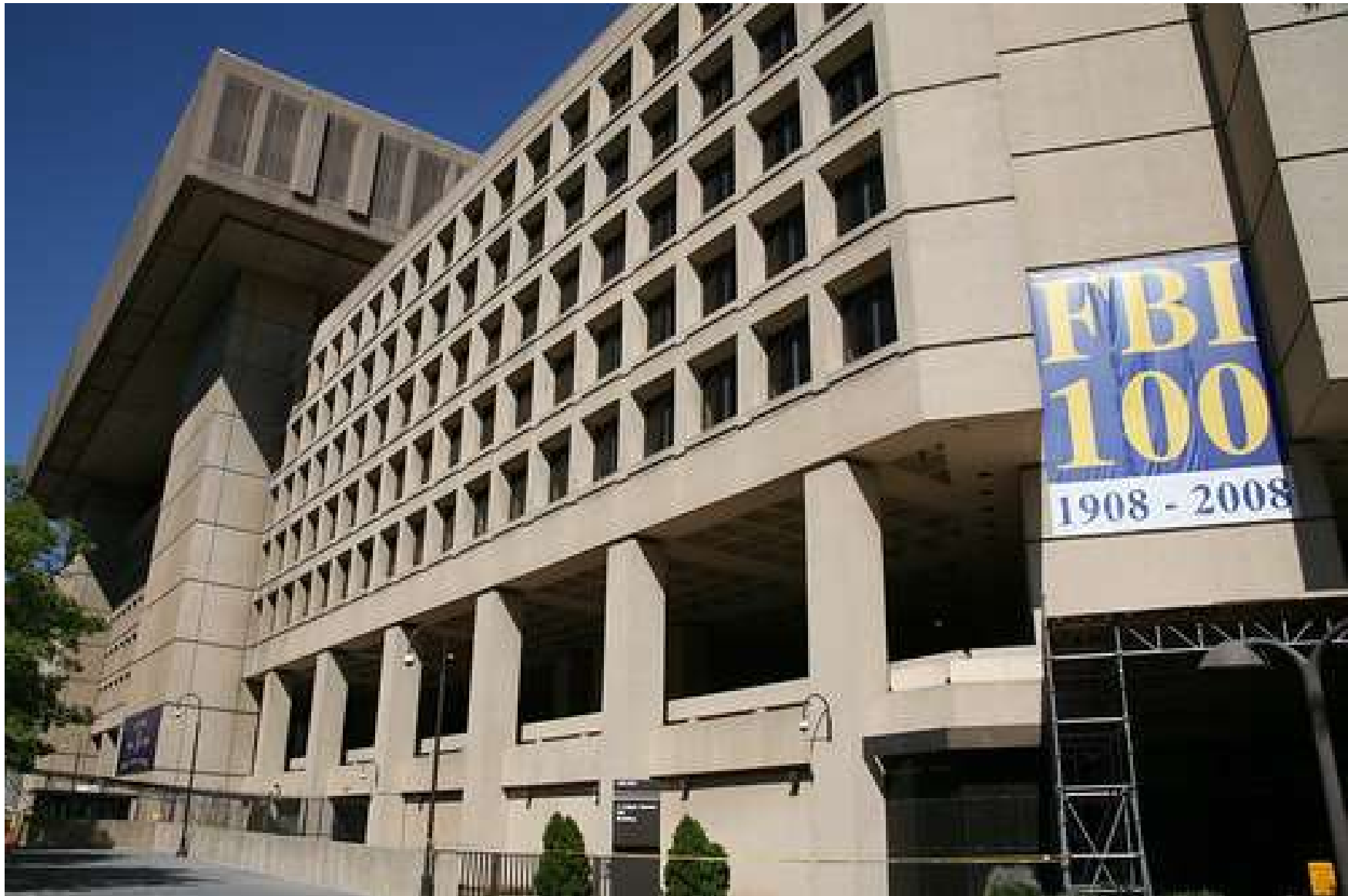
FBI Building Washington, DC