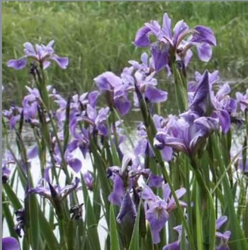
Blue Flag Iris

http://www.ncdot.org/doh/Operations/dp_chief_eng/roadside/wildflowerbook/graphics/images/page14a.jpg