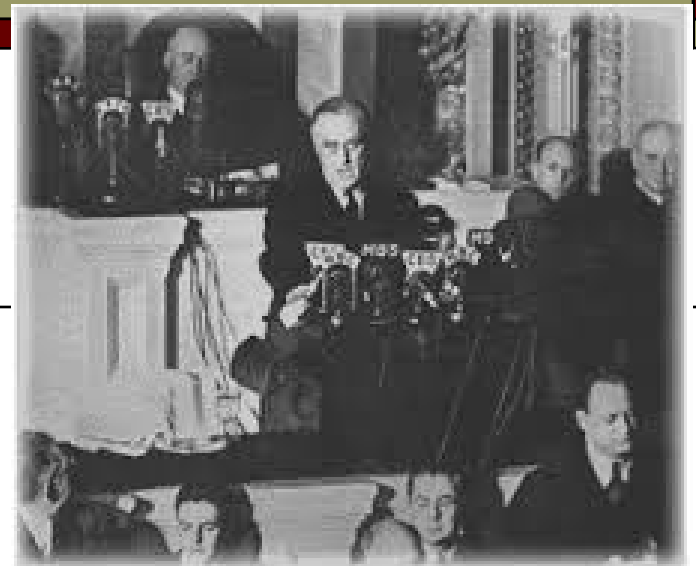
FDR delivers Pearl Harbor Speech - December 8, 1941.