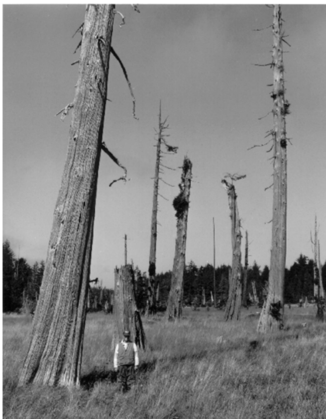
Scientists study dead trees in a tidal marsh along the Pacific coast of Washington. They provide evidence that a great earthquake occurred in January 1700.