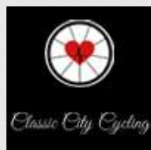
Classic City Cycling