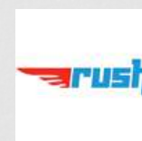
Rush Athens Trampoline