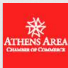
Athens Area Chamber of Commerce