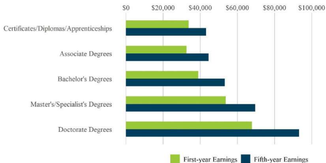
Figure 1. Median First- and Fifth-Year Earnings by Credential

In addition to earnings outcomes, we also look at the number of graduates by credential. Figure 2 shows the number of graduates over the same five-year period, which indicates that the associate degree is the most commonly awarded postsecondary credential in Florida (approximately 35% of all certificates/degrees awarded), followed closely by the bachelor's degree (34%). In addition, a significant number of students graduated from a certificate, diploma, or apprenticeship program (20%). Graduates from advanced degree programs represent the smallest group of total graduates (11%).