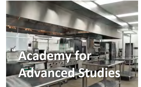
Academy for Advanced Studies