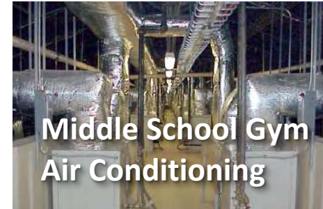
Middle School Gym Air Conditioning