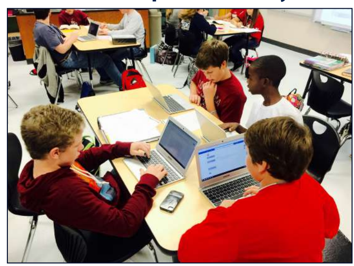
Sixth grade students work on technology in the classroom.

On January 5, 2015, Thomas County Upper Elementary and Thomas County Middle School will hold its second annual "Techno Expo." On this professional learning day, teachers will attend sessions in order to learn how to integrate technology into their classrooms.