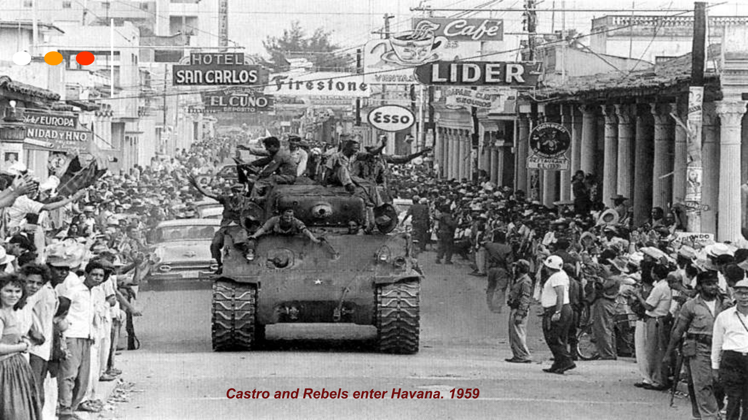
Castro and Rebels enter Havana. 1959