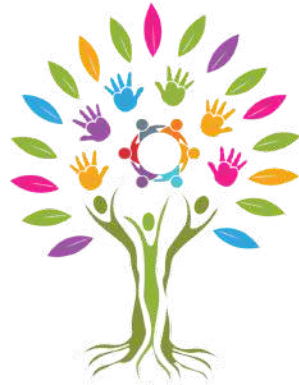
Growing Our Future

The school district is located just 17 miles for Downtown Atlanta and Clayton County houses the world's busiest airport – Hartsfield-Jackson International Atlanta Airport. CCPS offers a variety of learning options such as traditional schools, fine arts magnet schools and/or programs, Career, Technical, and Agricultural (CTAE) Pathways, online courses, and Gifted Education Programs. The school district also provides state-of-the-art facilities for community and district growth including the Clayton County Public Schools Performing Arts Center and the S. Truett Cathy Professional Learning Center.