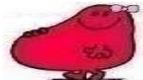
The One That Always Hungry