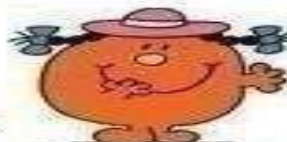
The Cutie Pie