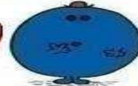
The One With The Bad Memory