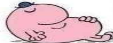
The Lazy One