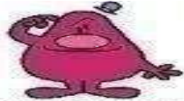
The Slow One