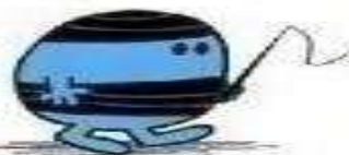
The One That Always Gets Hurt