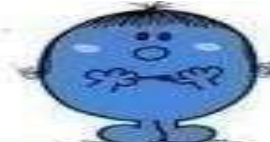
The Shy One