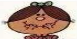
The Innocent One