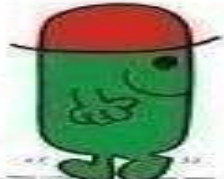
The Goodie Two Shoes