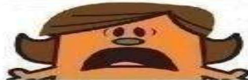
The Drama Queen