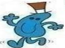
The One You Can Depend On