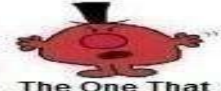
The One That Always Swears