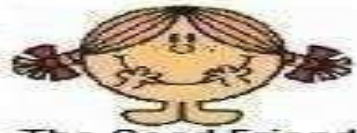
The Good Friend