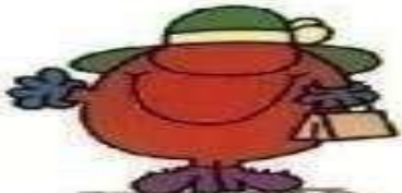
The Stylish One