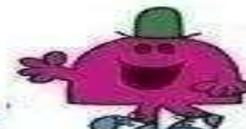
The Funny Guy