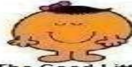
The Good Little Church Girl