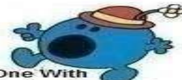
The One With All The Gossip