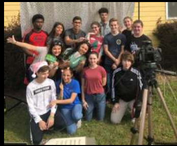
Caterpillar to Butterflies Christmas Party