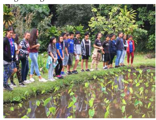
Checking out the lo'i at the Hawaiian Studies Department. Learning the importance of Hawaiian culture for our future.