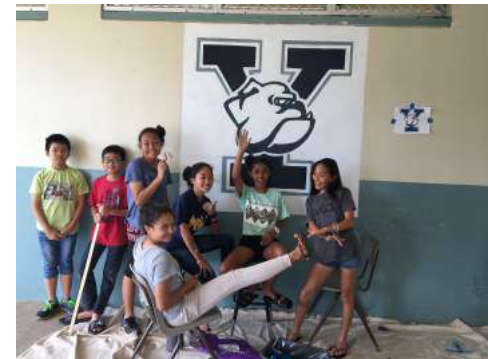
The 7th grade AVID class showing off their painting skills, taking on Yale.