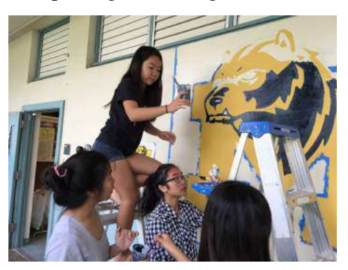
The 8th grade AVID class putting the finishing touches on Michigan.