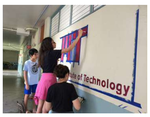
Massachusetts Institute of Technology takes a steady hand.