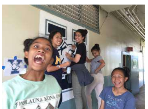
There are so many hams in the 7th grade AVID class.