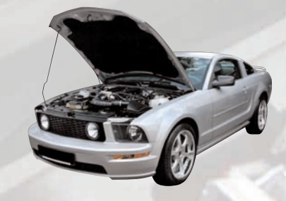
Whatever your path, the automotive service and repair industry is broad enough to make your dreams come true for years to come.