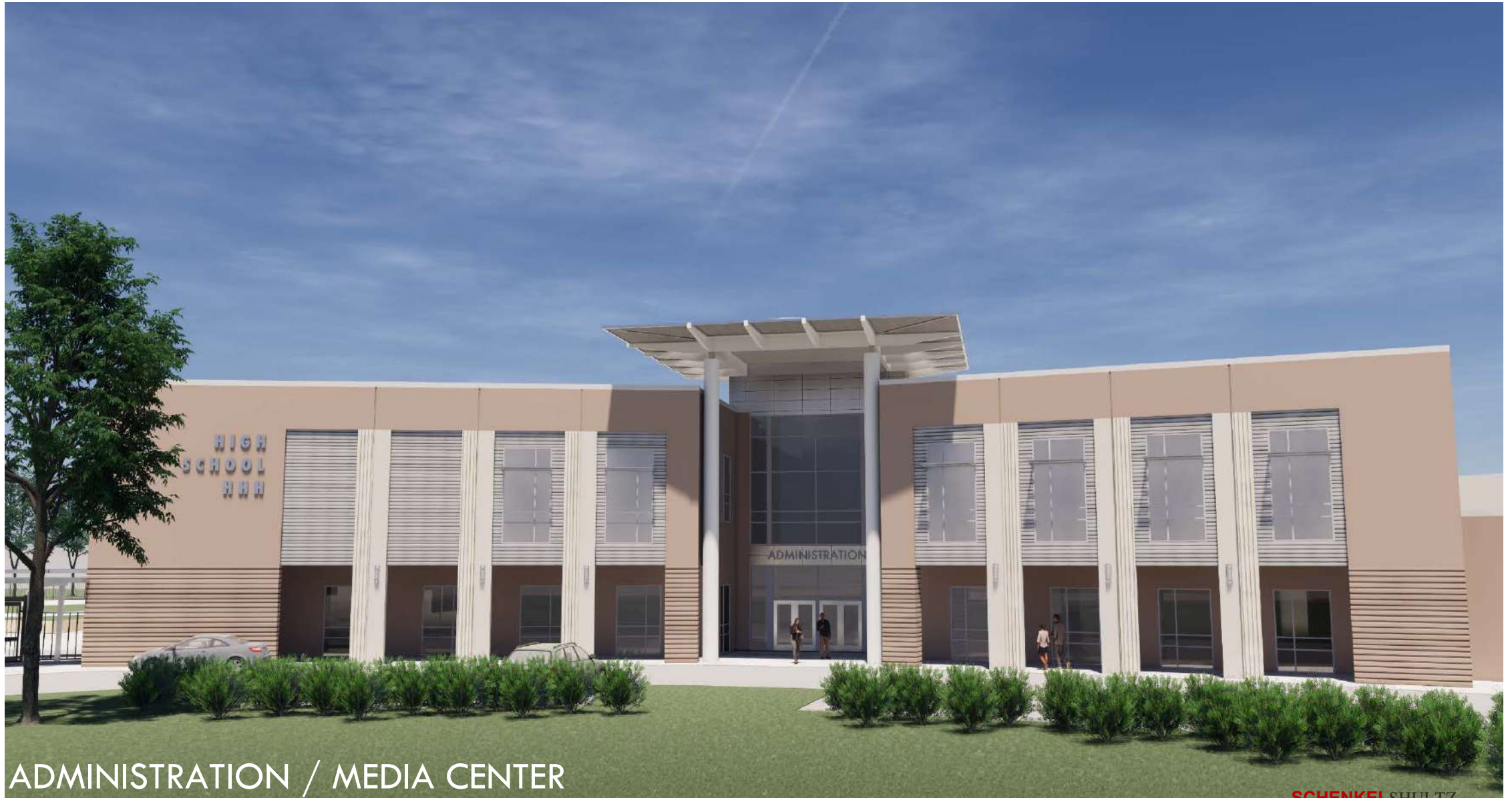
ADMINISTRATION / MEDIA CENTER