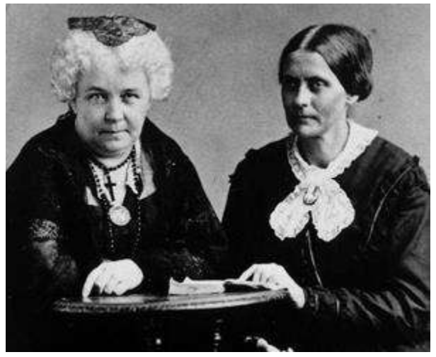
Library of Congress LC-MSS-34355-36