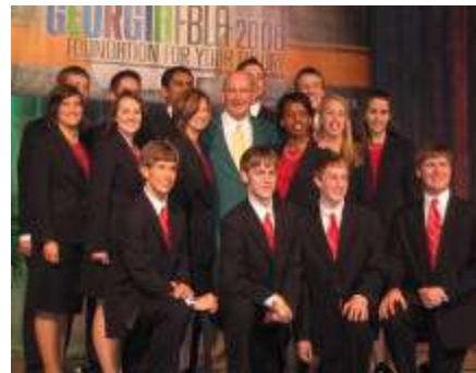
Governor Sonny Perdue poses for picture with FBLA State Executive Officers.

Over 2,800 members and advisers of the Future Business Leaders of America recently convened at the Hyatt Regency Atlanta for the 58th Annual Georgia State Leadership Conference. Members competed in nearly sixty different competitive events to determine the top business students in the state and to see who would represent Georgia FBLA at the National Leadership Conference held in Nashville in July. Many of the competitive events utilized a new online testing system.