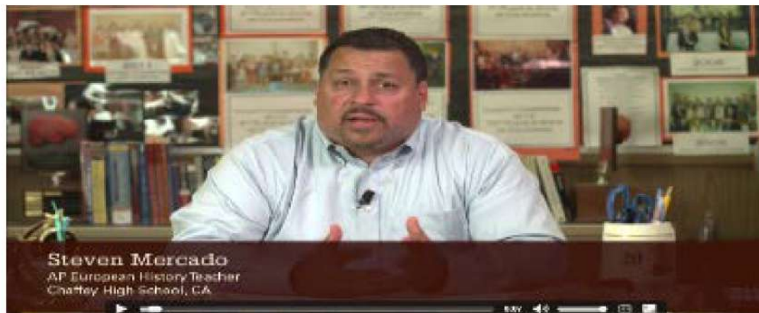
Video guidance from master teachers