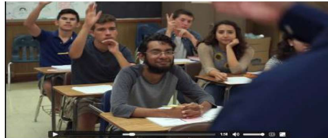
Classroom footage of effective techniques