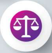
Exhibit Strong Personal Qualities