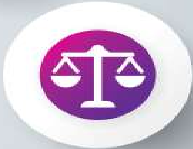
Exhibit Strong Personal Qualities