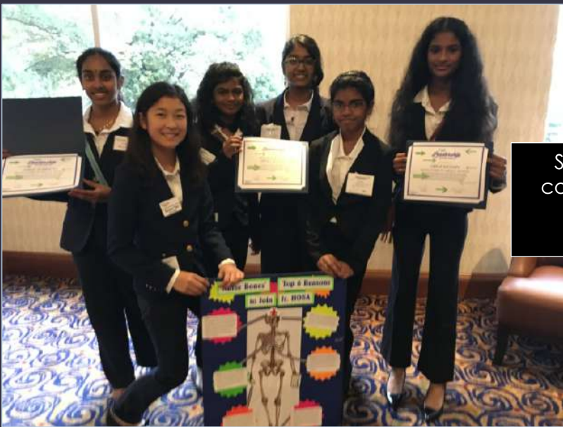
Students in HOSA compete at the Fall Leadership Conference