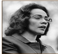
Coretta Scott King graduated from Antioch with a B.A. in music and education and won a scholarship to the New England & Conservatory of Music in Boston, MA. Just like Coretta, our girls are college bound!

ELA6W2.a. Expository - Creates an organizing structure appropriate to purpose, audience, and context.