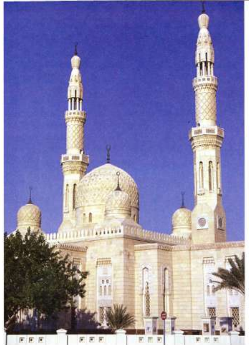
This mosque has two minarets. Muezzins climb up into them to chant their calls to prayer out over the town.