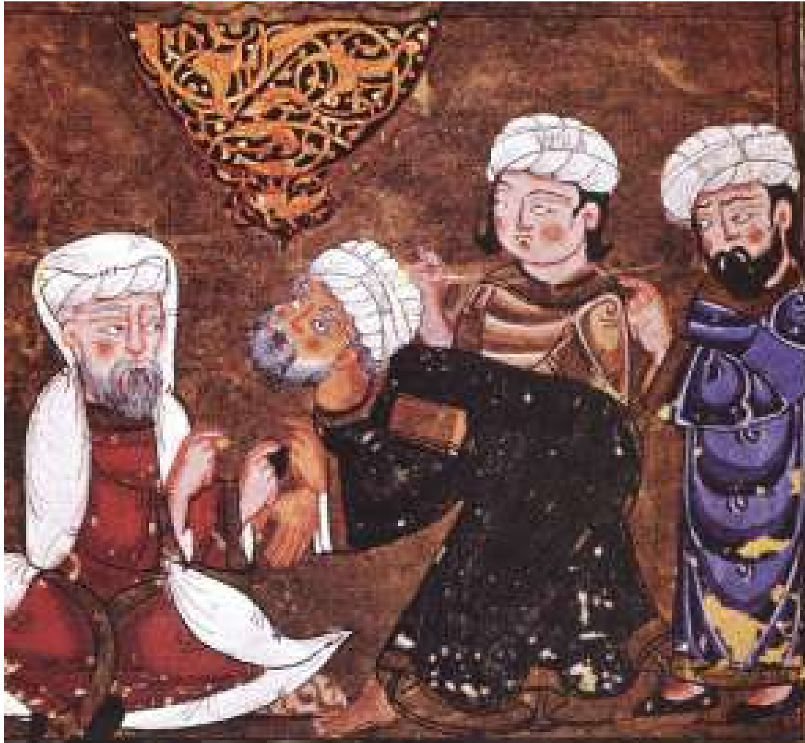
A shari'ah court is shown on this page from an illuminated manuscript dated 1334 C.E.