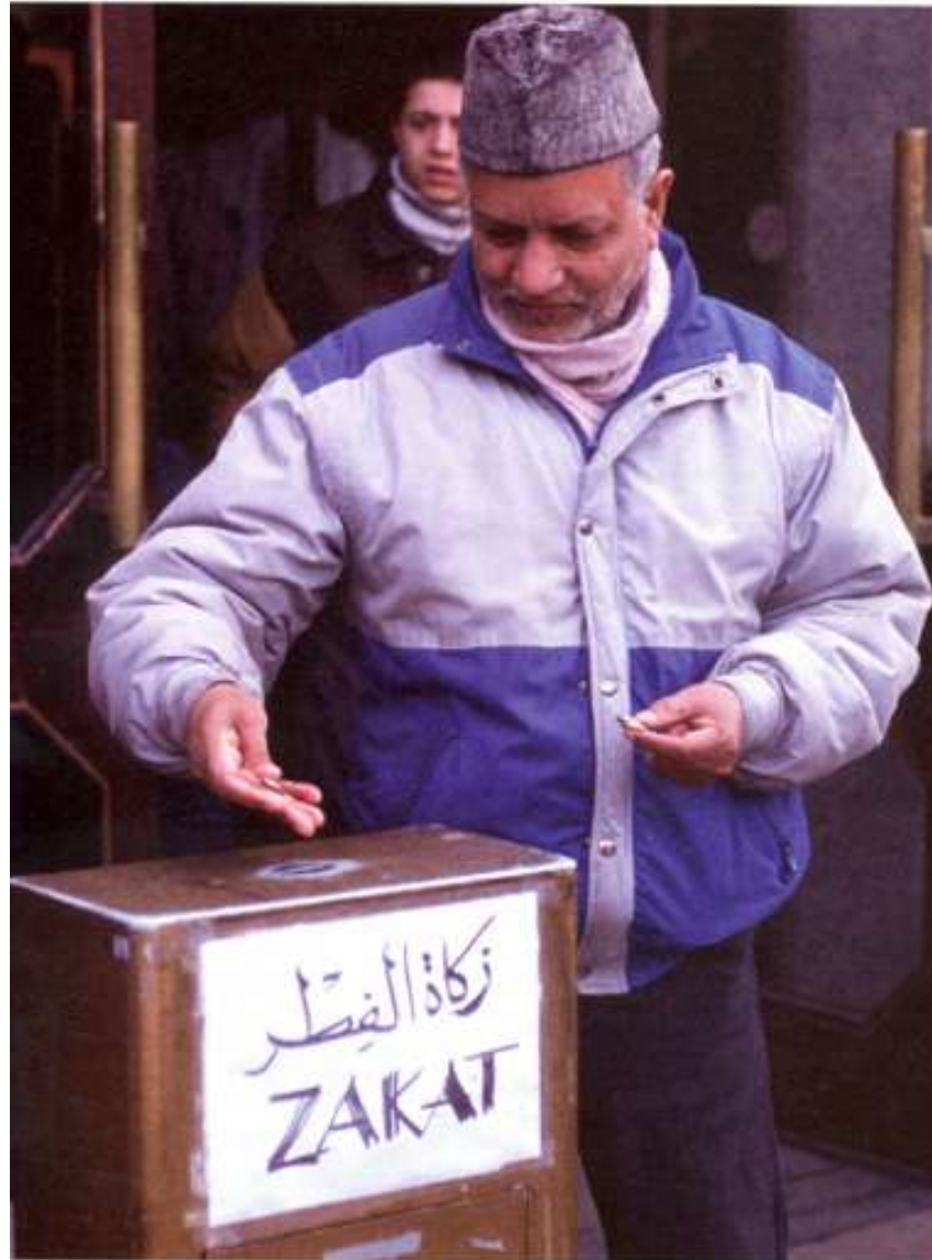
Through zakat, Muslims give to the poor or needy.