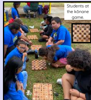
Students at the kōnane game.