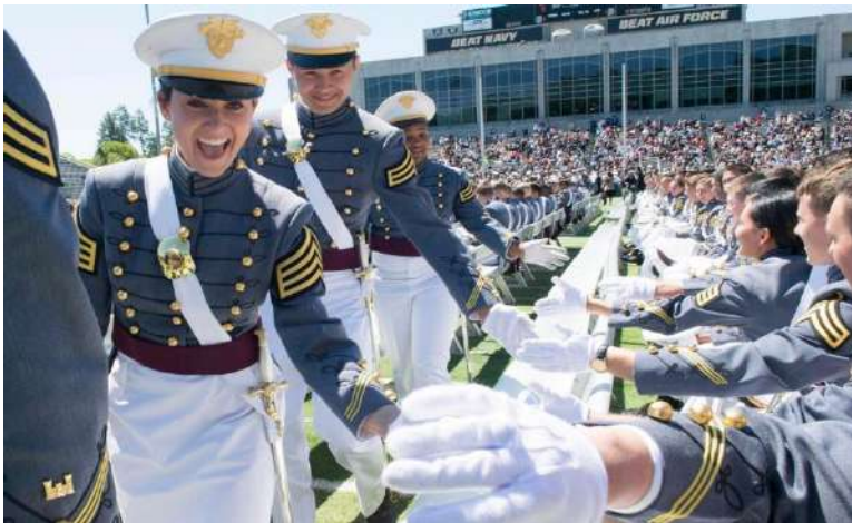
U.S. Military Academy West Point www.westpoint.edu