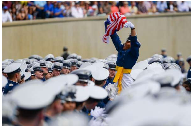
U.S. Air Force Academy www.usafa.af.mil