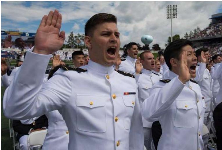
U.S. Naval Academy www.usna.edu

Please note, the U.S. Coast Guard Academy does not require a Congressional Nomination