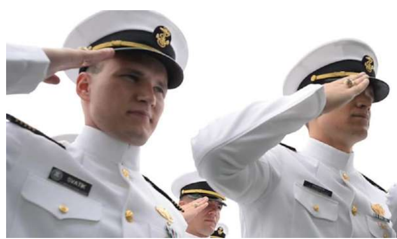
U.S. Merchant Marine Academy www.usmma.edu