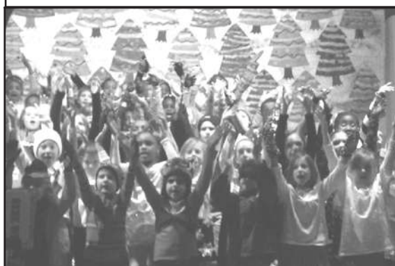
Second grade students "Bring Om The Snow"

The second grade Musical was followed up by the third and fourth grade Sunnyside Chorus. The chorus performed several numbers including "Jingle Bell Rock", "Dona Nobis Pacem", and one of the crowd's favorites, "Swingin' in a Holiday Mood." The evening was full of the Holiday Spirit and the audience left with smiles and wonderful memories.