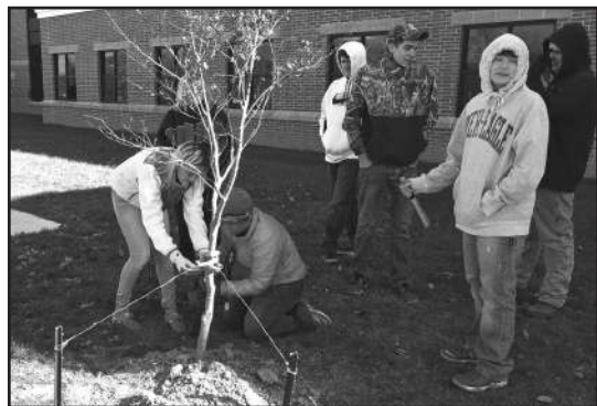
Plant Science II students assisted with the project helping to plant and stake the maples in November.