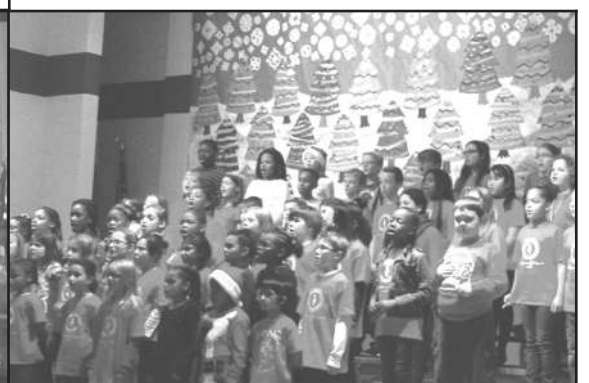
Sunnyside third and fourth grade chorus. 2014 Winter Concert