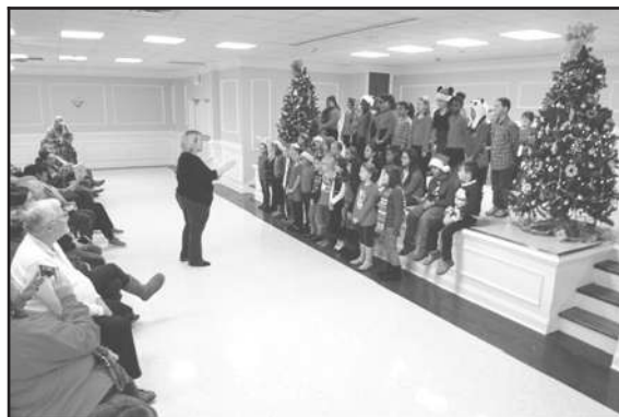
Town of Clayton Tree Lighting. Third and fourth grade chorus members.

The Sunnyside Music Department has once again put on an amazing Winter Concert this year! The second grade students opened the show with their Winter Musical "Bring on the Snow!" The singing was spectacular and the dance moves were mesmerizing!!! You can certainly tell that the students worked extremely hard to put on a fabulous show!