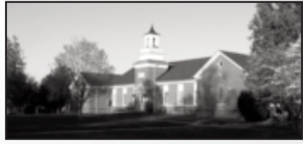
Clayton Elementary School