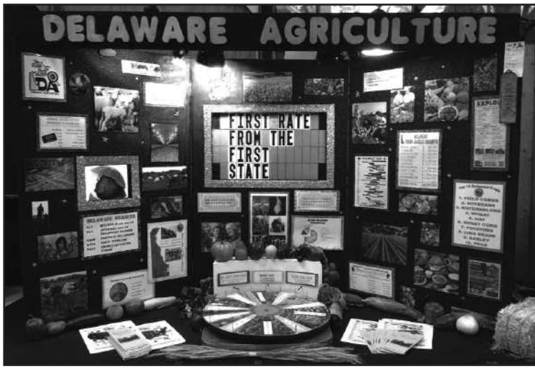
Students & teachers make district proud