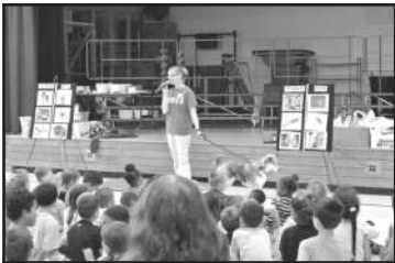
Humane Society guest speaker and canine pal

Smyrna Elementary students were treated to an assembly sponsored by the Humane Society. Children learned about jobs that involve animals, ways to safely approach animals, and proper ways to care for pets.