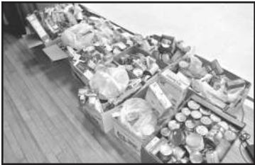
food items collected during the week

Compassion was in the air at SES! Students who donated non-perishable food to either the Humane Society or the local food pantry, or who performed a random act of kindness, were awarded a compassion ticket. After all tickets were collected, students were chosen from each class as compassion winners. Thanks, SES students, for being so kind!