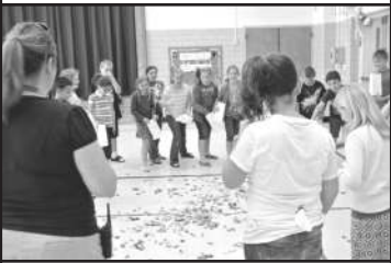
...the piñata contents

Compassion was in the air at SES! Students who donated non-perishable food to either the Humane Society or the local food pantry, or who performed a random act of kindness, were awarded a compassion ticket. After all tickets were collected, students were chosen from each class as compassion winners. Thanks, SES students, for being so kind!