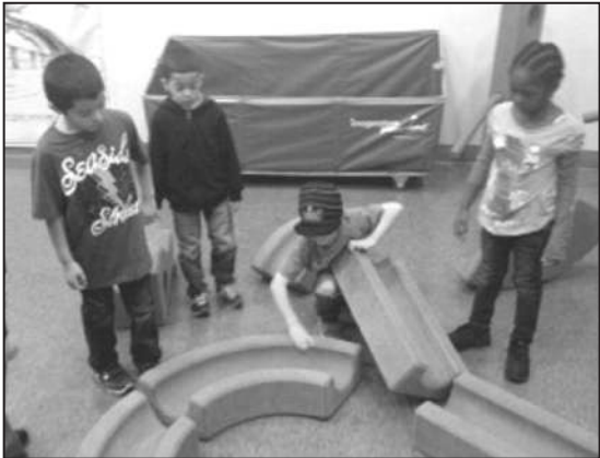
First graders looking for the best way to roll a ball down a ramp.

First grade students recently traveled to the Children’s Museum for a fun day of learning and experimentation.