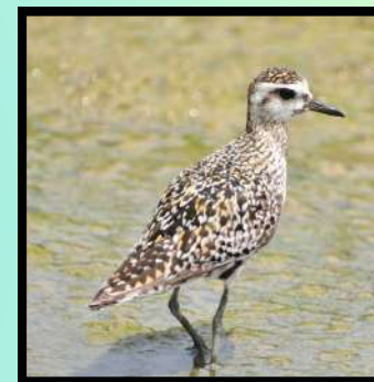
*Resources used for this article are: Hawaii Magazine, 19 Kōlea Bird Facts - Facts.net, mybirdingjourney, and Honolulu Zoo Society.

As the school mascot, the kōlea bird symbolizes and inspires us to learn, share knowledge, adapt to change, embrace our differences, and persevere through various challenges we may encounter.