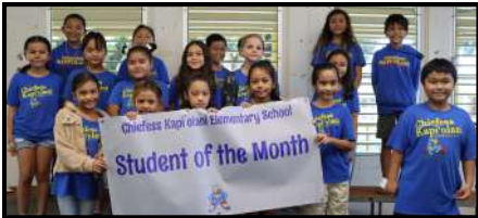
Pictures below are of our Student of the Month award recipients for October, November, and December.

Congratulations, students, for your accomplishments. ( List of award recipients are on page 7 )