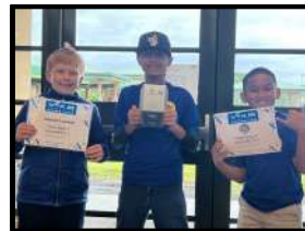
KōleaBots at Kamehameha School. Awesome Job, KōleaBots and congratulations to team 96601E for receiving the Innovate Award.