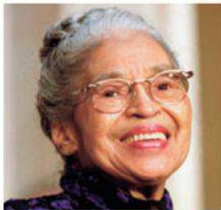
▲ As secretary of the Montgomery chapter of the NAACP, Rosa Parks had protested segregation through everyday acts long before September 1955.

In later years, the Court did overturn the separate-but-equal doctrine, and it used the Brown decision to do so. For example, in 1955, Rosa Parks was convicted for violating a Montgomery, Alabama, law for segregated seating on buses. A federal court overturned the conviction, finding such segregation unconstitutional. The case was appealed to the Supreme Court, which upheld without comment the lower court’s decision. In doing so in this and similar cases, the Court signaled that the reasoning behind Plessy no longer applied.