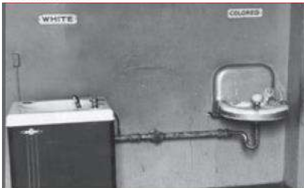
▲ One result of Jim Crow laws was separate drinking fountains for whites and African Americans.

Plessy claimed that segregation violated his right to equal protection under the law. Moreover he claimed that, being “of mixed descent,” he was entitled to “every recognition, right, privilege and immunity secured to the citizens of the United States of the white race.”