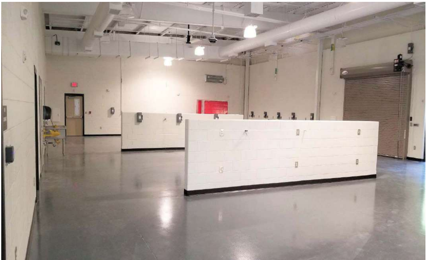
Interior View - Lab