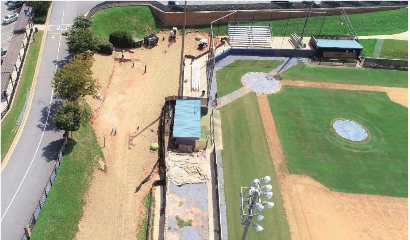
Aerial View – Baseball Field