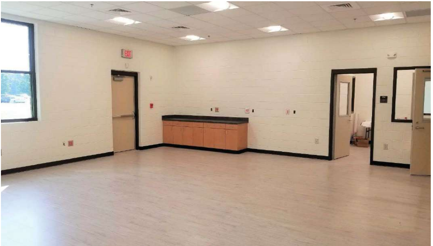
Interior View – Classroom