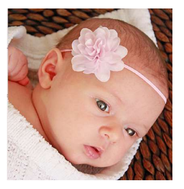
Brookfield Public Schools WOW!

Sentence: Even though the newborn had sparse hair, her mom had her wear an adorable headband.