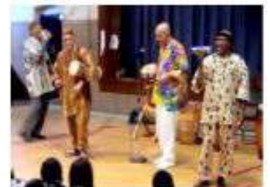
Mikata Celebrating African American Music at Kingsbury

In celebration of African American History Month, Kingsbury students were treated to an awesome performance by "Mikata". Mikata is a program of powerful rhythmic music and dance that carries you to the cultures of Nigeria, Ghana, Puerto Rico, Haiti, Jamaica, Dominican Republic and the U.S.