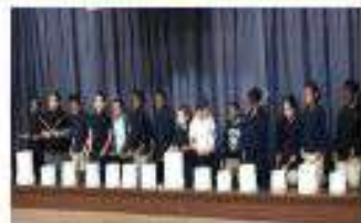
3rd Grade STOMP Band Concert