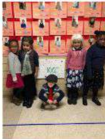
100th Day Celebration

Waterbury, CT - The Kingsbury Kindergarten team organized a unique way to celebrate the first 100 days of school. Students and staff were asked to dress as if they were 100 years old and the results were amazing! Visit the Kingsbury website to view more photos of the imaginative costumes!