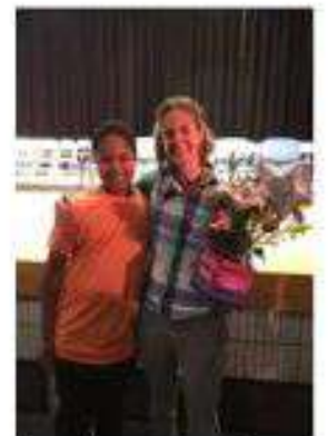
Story on page 3