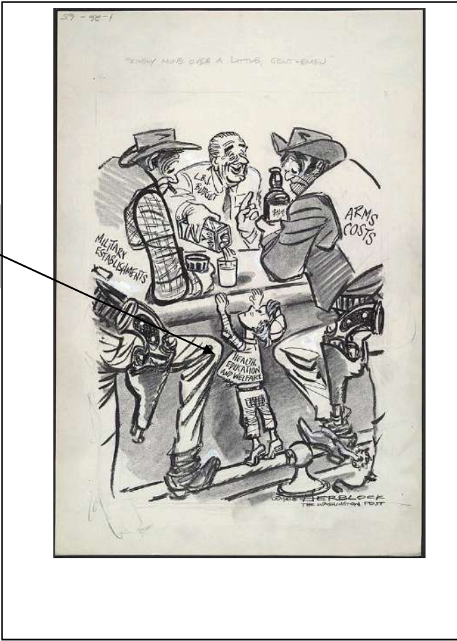
"Kindly move over a little, gentlemen." Washington Post, 1963