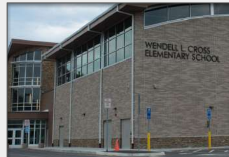
Wendell L. Cross Elementary School