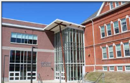
Duggan Elementary School