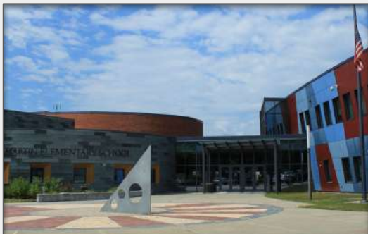
Gilmartin Elementary School