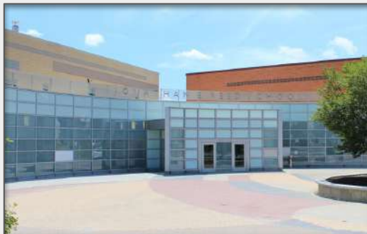
Jonathan E. Reed Elementary School