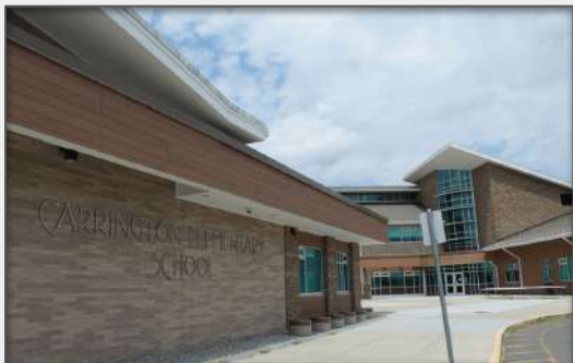
Carrington Elementary School