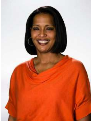
JAHANA HAYES, teacher, Kennedy High School Waterbury Teacher of the Year, Connecticut State Teacher of the Year

There is an energy and creativity that exists among the students in Waterbury that is unmatched. Once that spark is ignited the possibilities are endless. I could never have experienced the same success as a teacher in another