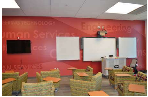
Library / Media Center