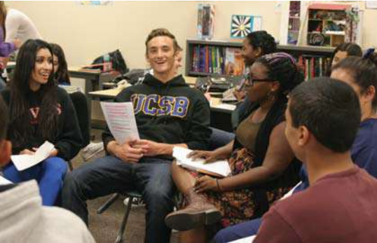
Above: AVID students engage in a Socratic seminar at Murrieta Mesa. Below: Warm Sp;ings AVID students take time in class to get tutoring on their homework.

With college admission requirements becoming more and more competitive each year, middle and high school students are encouraged to talk to their school counselor to learn how the AVID program can make their college application stand out above the rest.