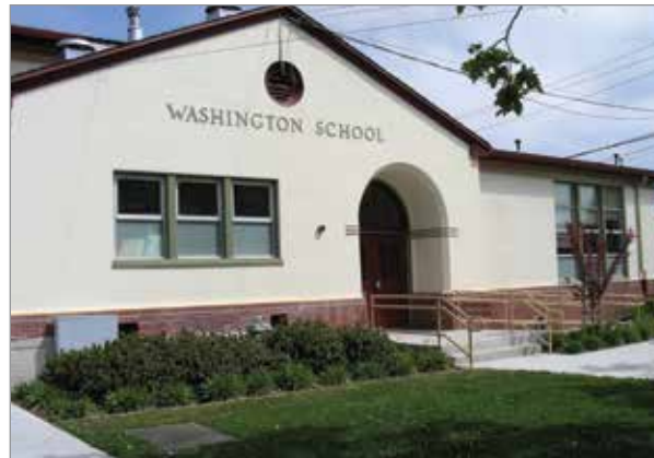
The City will partner with public agencies including the West Contra Costa Unified School District expand programs and services to meet growing demand.

The demand for human services is growing. The City will strengthen its coordination with County, state and nonprofit providers to improve delivery and effectiveness of services across the community. Improved transportation connections and expanded mobile programs and services can help connect people to educational and human services.