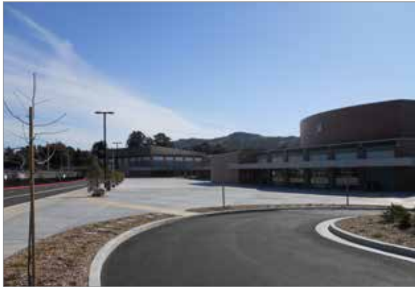
DeAnza High School

Children's Foundation and offers preschool and elementary school serving a total of 80 students.