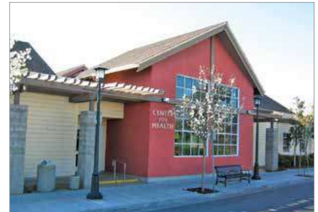
Neighborhood-based facilities can deliver high-quality services to residents close to where they live.

Public education faces significant challenges in managing demographic changes, budget shortfalls, shifting curricular priorities and facilities maintenance. Demand for vocational education and English language acquisition programs are on the rise, while declining district enrollment has resulted in some school closures. Additional resources are needed to meet residents’ needs for preschool and childcare especially for infants. Richmond will enhance the education system by: