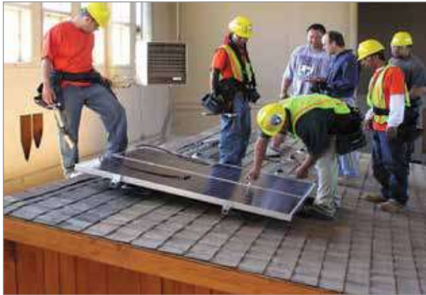
Workforce training programs such as RichmondBUILD prepare Richmond residents for emerging industries.