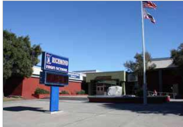
Richmond High School