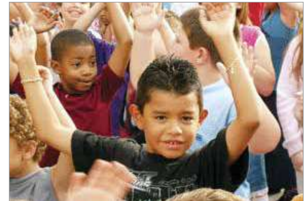
Education and human services programs have to meet the needs of a diverse community.

Richmond is committed to supporting expansion of its education and human services resources to address community needs. Although it is not a state-