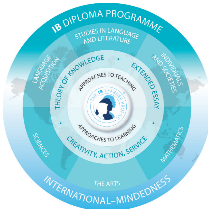
Figure 1 Diploma Programme model

The course is presented as six academic areas enclosing a central core (see figure 1). It encourages the concurrent study of a broad range of academic areas. Students study two modern languages (or a modern language and a classical language), a humanities or social science subject, an experimental science, mathematics and one of the creative arts. It is this comprehensive range of subjects that makes the Diploma Programme a demanding course of study designed to prepare students effectively for university entrance. In each of the academic areas students have flexibility in making their choices, which means they can choose subjects that particularly interest them and that they may wish to study further at university.