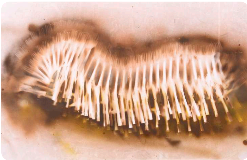
Best of Show artwork Feather in Flight by 10th grader CJ Goldsmith from The Montgomery Academy