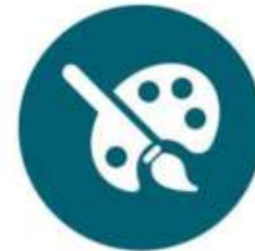
6. Visual Arts