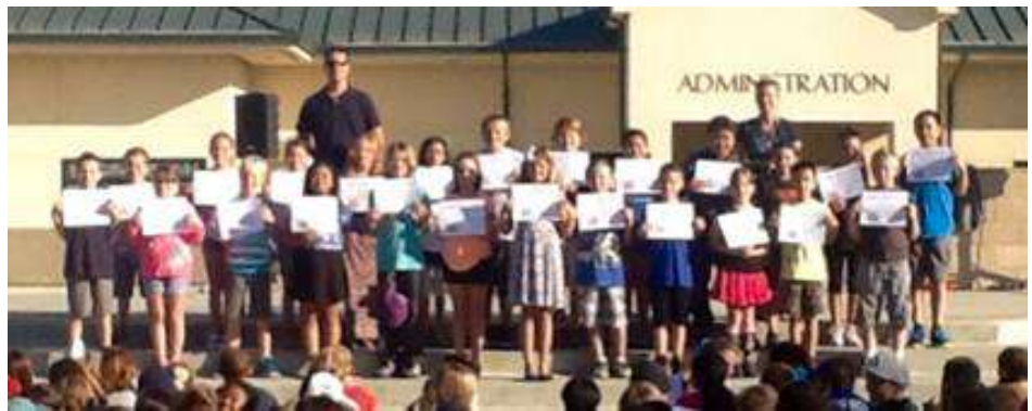
4 th and 5 th