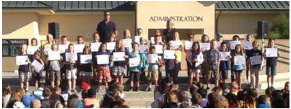
1 st – 3 rd