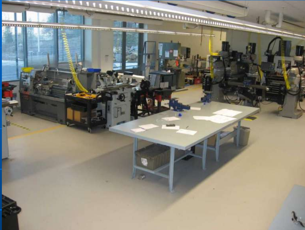
Manufacturing Shop Floor