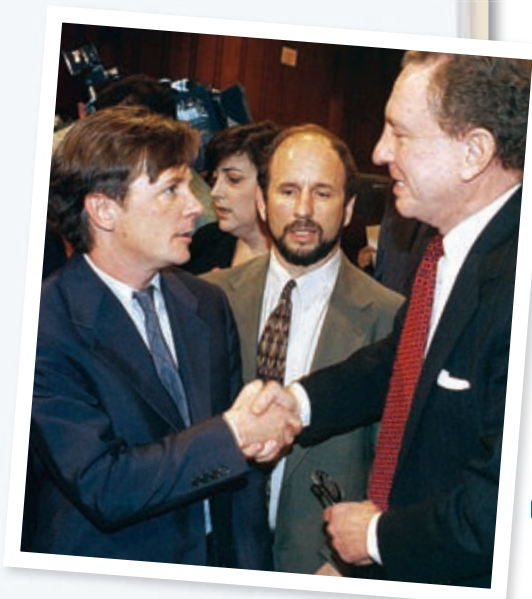
Fox is greeted by Senators Paul Wellstone and Arlen Specter.

The Parkinson's community strongly supports your efforts to double medical research funding. At the same time, I implore you to do more for people with Parkinson's. Take up Parkinson's as if your life depended on it. 100 Increase funding for Parkinson's research by $75 million over current levels for the coming fiscal year. 2 Make this a down payment for a fully funded