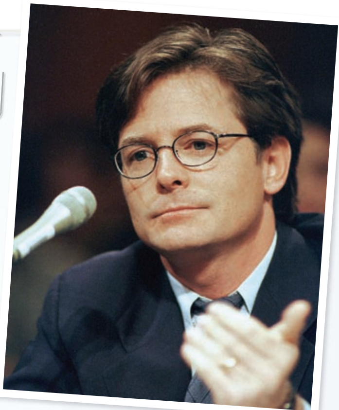
Michael J. Fox testifies before the U.S. Senate.

Some, or perhaps most of you are familiar with me from 20 years of 20 work in film and television. What I wish to speak to you about today has little or nothing to do with celebrity—save for this brief reference.