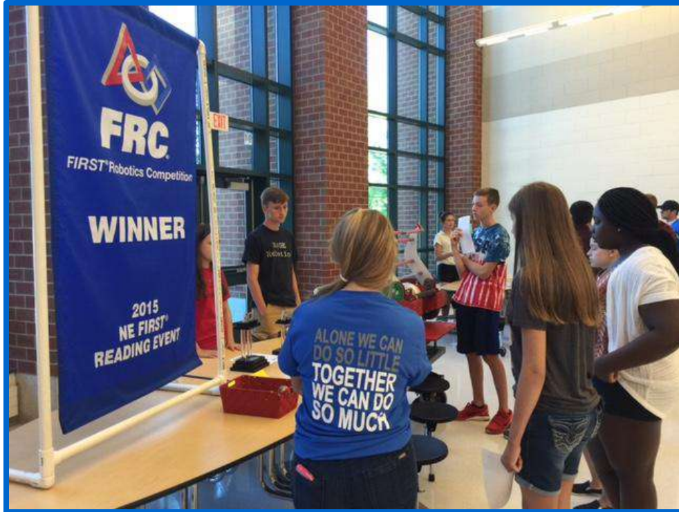
Pictured above: Students listen to a representative of the Rage Robotics Team during the Club Fair rotation.