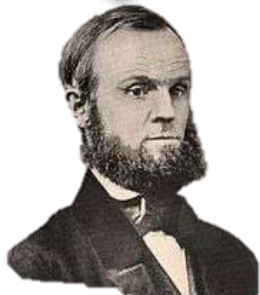
John Humphrey Noyes

We share everything – and I mean EVERYTHING