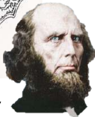
Charles Grandison Finney