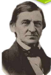
Ralph Waldo Emerson

Truth is found in the Bible. Come to a camp meeting for goodness sake!