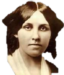
Louisa May Alcott