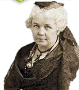
Elizabeth Cady Stanton

Everyone used to work at home. Now, men go to work in a business or factory, but what should women do?