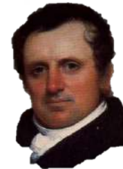
James Fenimore Cooper