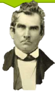
Peter Cartwright, Methodist preacher