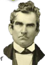
Peter Cartwright, Methodist preacher