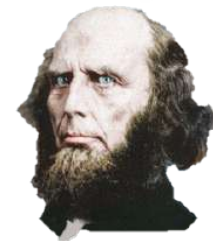
Charles Grandison Finney