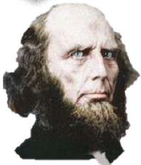
Charles Grandison Finney