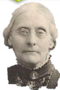
Susan B. Anthony