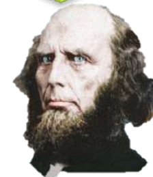
Charles Grandison Finney

Truth is found in the Bible. Come to a camp meeting for goodness sake!