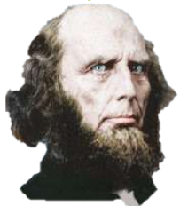
Charles Grandison Finney

You are not predestined for heaven or hell.