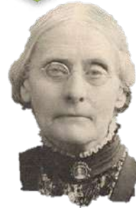
Susan B. Anthony

A key feature of the Second Great Awakening was the number of middle-class women (the wives and daughters of businessmen) who stayed true to church doctrine and turned to saving the rest of society after helping bring their families back to God.