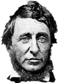
Henry David Thoreau

It's not what you look at that matters, it's what you see.