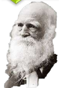
William Cullen Bryant