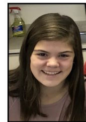
BY AMELIA E.