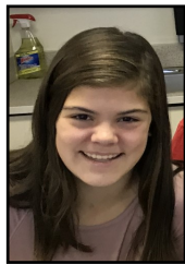
BY AMELIA E.