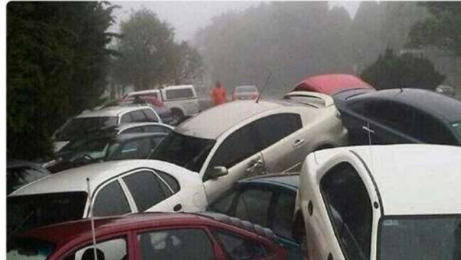
Freshman 0.006252 seconds after the bell rings

"you support gay rights so you must be gay"